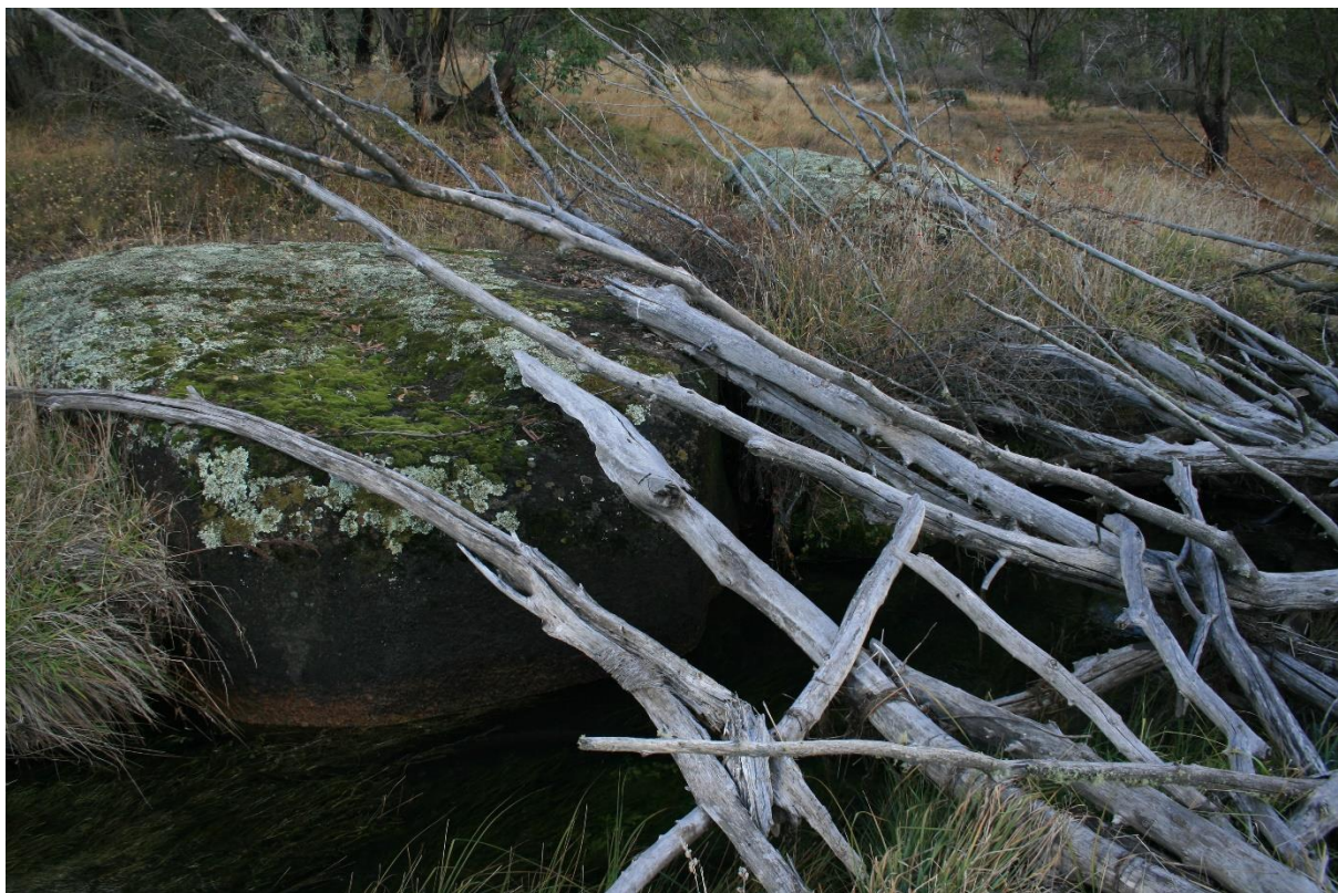
Remains of footbridge 27 May 2008